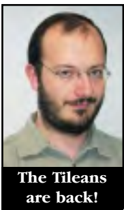
The Tileans are back!

Unlike other Warhammer armies, the Dogs of War do not come from a particular place, nor do they comprise a particular race, although men do feature very strongly amongst their number. They are bands of warriors who live by fighting – fighting for pay, fighting for adventure and, most importantly of all, fighting for the chance to win fabulous wealth. Some are merely bandits, pirates and cut-throats of the most untrustworthy kind, but others are