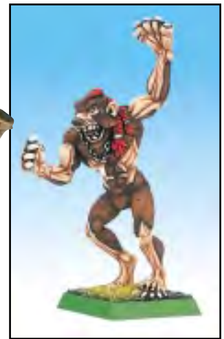
Beorg Bearstruck, leader of the Bearmen