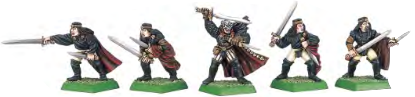
'Vengeance with a Smile' – Vespero's Vendetta