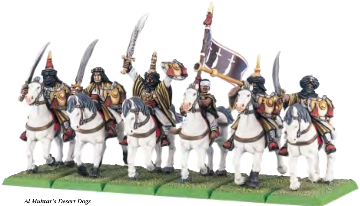
Al Muktar's Desert Dogs