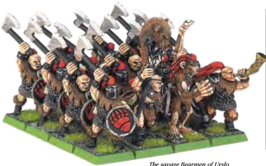
The savage Bearmen of Urslo