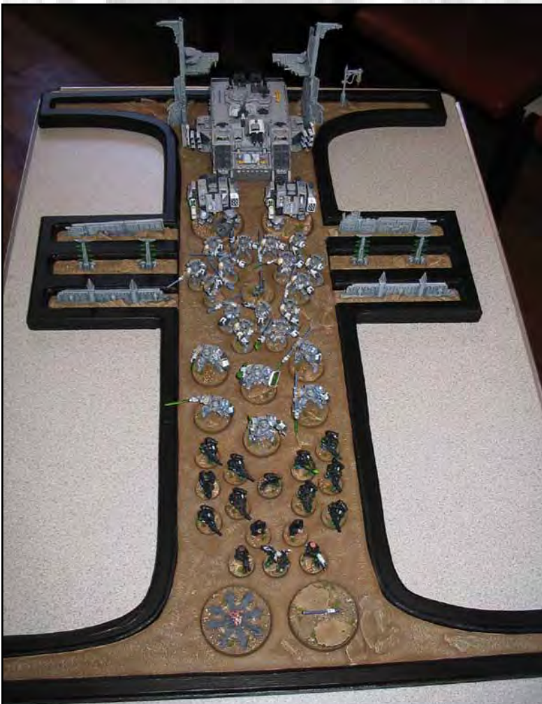
The Paladins of Titan complete with display base

Unfortunately in Paul's next turn his daemonettes arrived and munched both storm trooper units which was enough to