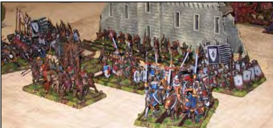
Gavin Miles' Bretonnian 'best' army