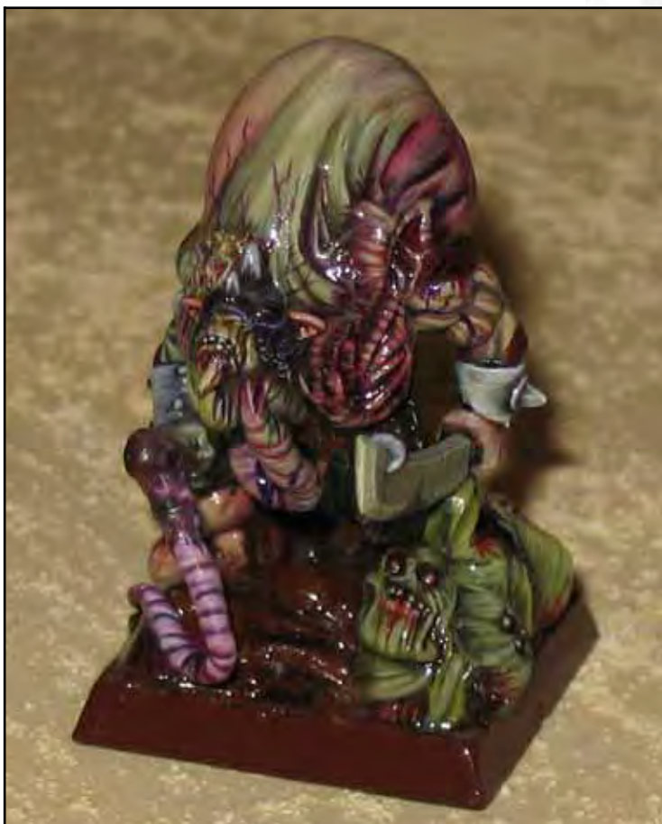
One of Craig Ivey's blobs from Regarding Retribution