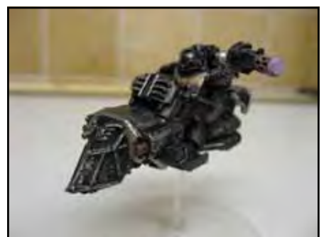
Look familiar? Well OJ did it first!!!!