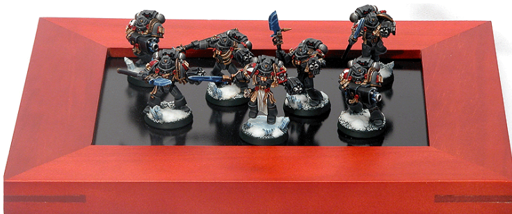
A very simple but effective display base

Summer is truly here. As I'm writing this article (slightly early it has to be said as its still June), its raining quite hard outside.