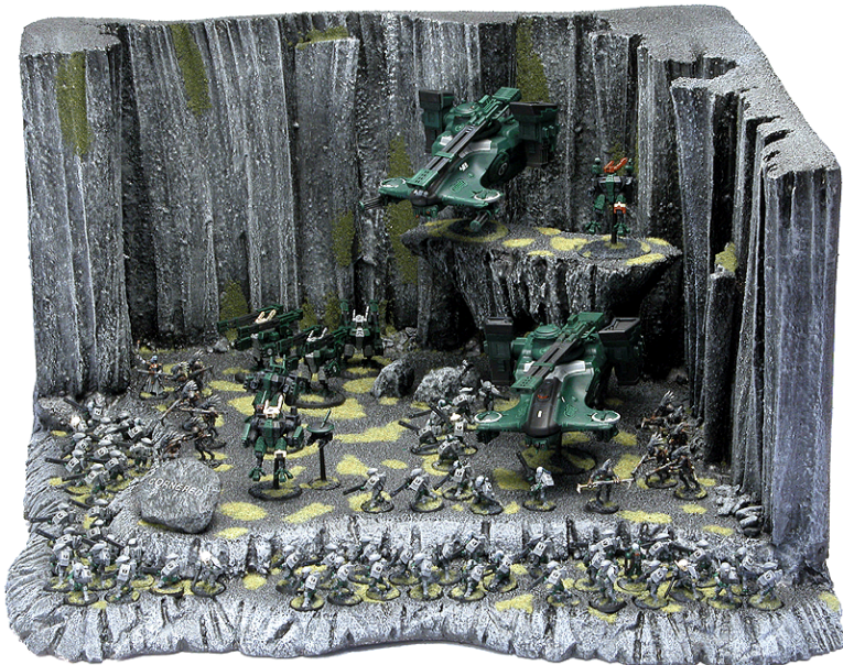
This display base tells a story, these Tau are making their last stand!

actually is. For starters, army lists tend to change several times during the life of the army so the display is likely to be used just once, at one event. Secondly, basing a large area is a completely different to doing a 25mm base and requires a lot more basing materials (and paint). And finally cutting the holes for your display base can be rather entertaining depending on your chosen material.