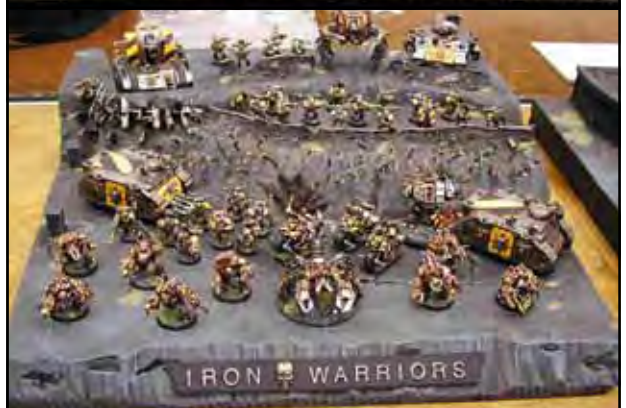
Display bases are a regular sight at the American and Canadian GTs (but please don't that put you off, they are still cool)

display designs into being (woodwork is not one of my strongest skills). The art to this is planning exactly how your display base will look and work. After that it is just