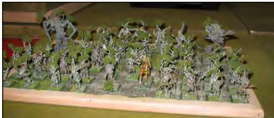
Richard Crane's Wood Elf display base from Regarding Retribution

Anyway, back to the topic... what is a display base? Well in simplest terms it's a tray for transporting and displaying your army on. So why bother? Well, during most events (be them campaign weekends or tournaments, or something else) players end up moving around a lot playing on different tables. A tray saves having to pack and unpack your army all the time and saves precious gaming time. However, a normal tray is not very interesting. From a creative viewpoint this simple need can be combined with the