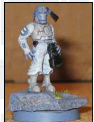
Aun'O Tsua'm, aka the boss