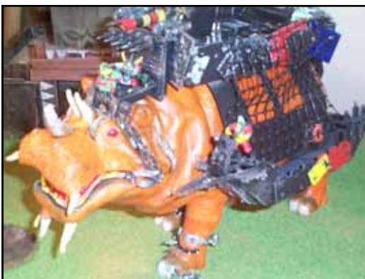
Then we come to "MONGO". Cute, cuddly, began as an animatronic hippo on special offer. (Yes, He roars, the mouth opens and His ears waggle!) A hacksaw and Dinosaur play set, Mark 2 Rhino chassis' plasticard and a delve into the Bitz box again. He fits 20 Boyz onboard (as he should do) and makes for a great centrepiece to the Army.

This is my attempt at a treatise on spicing up the modelling side of your hobby, an introduction to creating your own personalised Forces on the tabletop that look unique and enhance the gaming experience (also to promote the cause of the Waaaarrggghh!).