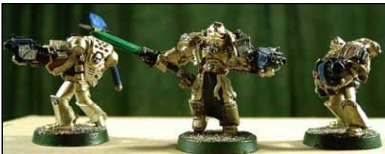
Left: Someone's new 'Christmas' Marines. Learn more about them and if they actually managed to make it to Starsmash IV next time. "Purge the unclean!"

*indicates dates the Newsletter is available