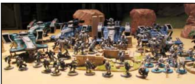
Richard's latest project: The Tau