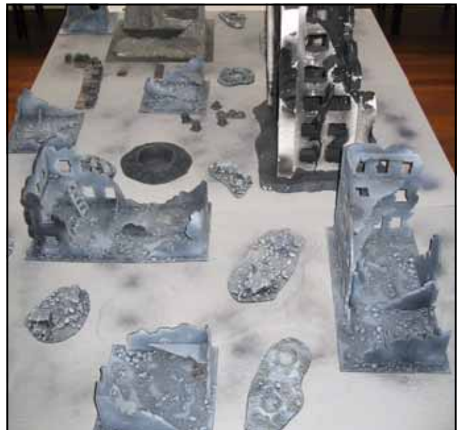
One of Paul's new city boards

The following day Other Muppet and Other Other Other Muppet arrived and it started again. First thing was to get more texture onto the green boards and Other Muppet showed us a different method which worked even better than the one I had used the day before. Whilst this was drying we again retired to my flat. Other Muppet immediately set to work cutting more MDF this time bases for some fifty odd trees. Taking the buildings that had been touched up yesterday we also set about the job of