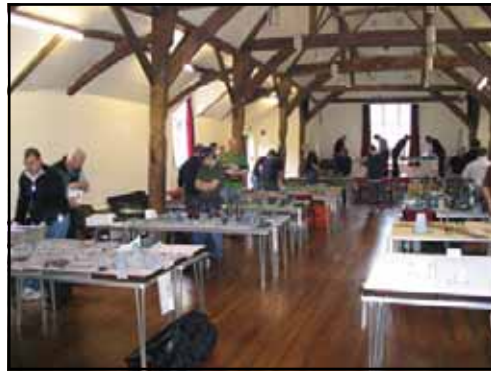
Let the games begin!