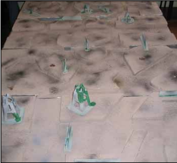
And one of Paul's wasteland boards, this time sporting an impressive trench system

rolls. Hours of gluing trees to bases and tickling up others later it was time to return to the garage and start on the wasteland boards. For these we used the quicker basing method using a colour called Pebble, it's pink ( ed - no it isn't ). Later that evening