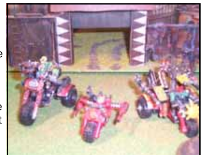
The scale of the normal Ork bike in the centre shows the build up of the Wazdakka Konversion on the right and the Warboss "Churlton" on the left. Up to 3 times the size of normal, to make them stand out. They were trike based for stability and the warboss was based on an Ogryn body, Ghazghul's head and powerklaw.