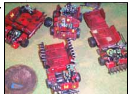
Ork Trukks slightly extended to fit in Da Boyz. With plasticard and offcuts, or bolt a big gun on the back and have a Speed Freeks Guntrukk.