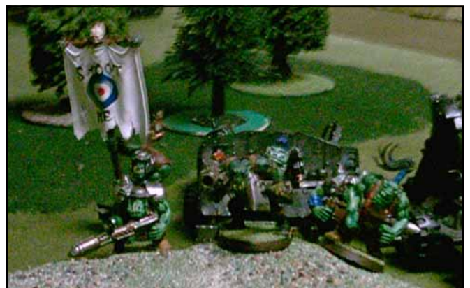
Orkies, obviously on loan from the RAF

The left flank opened up a withering hail of fire into the Necron Warriors in front of them dropping over 50% of them to bolter fire! However most of them got back up! It was at this point that I called the Terminator squads in