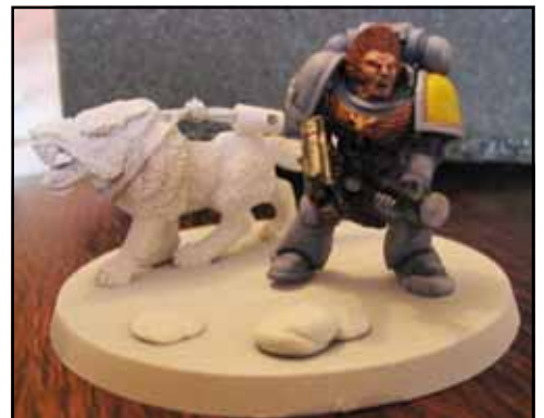
One of the 'in progress' Space Wolf sentries