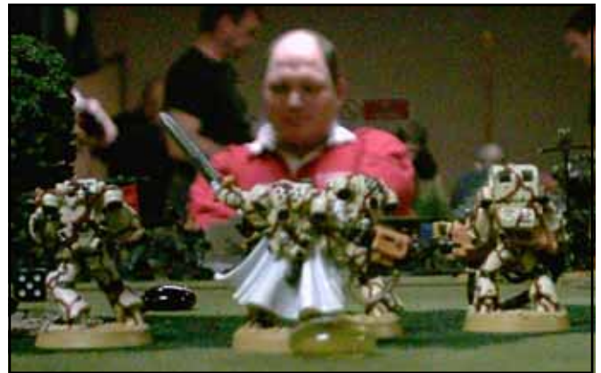
There' Nurgly Walker...get 'im!

Knight marines were still too far away along with the Grey Knight Terminators. In my turn I poured fire into the Landraider frying it on the third penetrating hit from the multi-melta from the Assault bike.