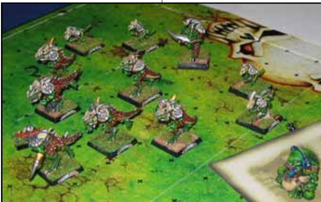
The painting winner!

the door's shut, and I'm finally on my way.