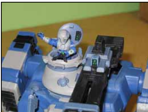
A Hammerhead tank commander scans the area

Of course thanks to Fio caste engineers the entire XV17 Burst Cannon package is as effective as any other employed by the Tau.