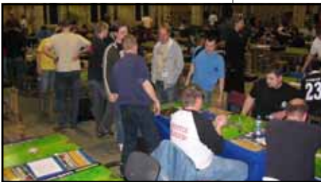
The Blood Bowl, just after round two

An hour later, after fixing his (cheap-ass) printer, I'm ready to go. I've my directions written down, and I'm on my way. Halfway to Newbury, and I realise I've forgotten my team "fluff". Decisions, decisions! Handwrite, or turn around and print it at my dad's? After five seconds, I turn the car round, and head back (handwriting not a strength - heh!)