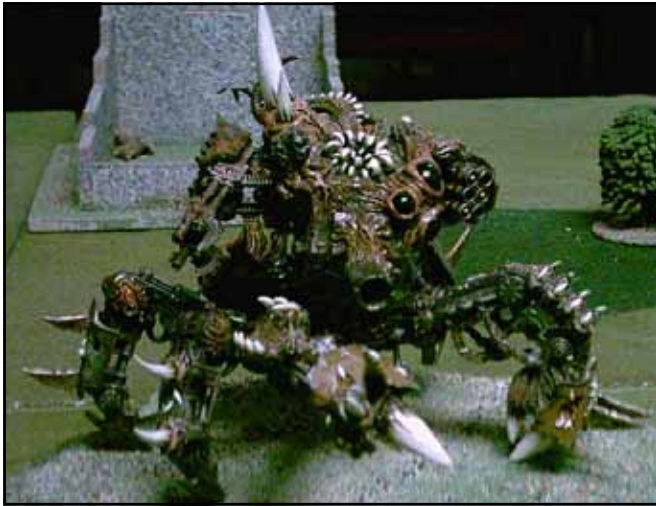
That's a very pretty Defiler

stood proud in the centre of the field hull down behind a hill, closely supported by a Terminator squad, a dreadnought and two marine Tac squads. On the flanks I placed my ten man scout squad and on the other my Land Speeder Tornado. Turn one came and the accursed Plague marines roared across the field, paying no heed to the rough terrain, the first of the Nurgle Rhino's leapt into the air over the rubble in front of their position, landed hard and then careered into the edge of the hill where the Vindicator was sheltering. Behind the onslaught the Nurgle Predator swung it's twin linked Lascannons to aim at the top of my Vindicator, with an ear splitting shriek the top of the Vindicator was torn away, causing the ammo to explode, killing two marines close by! As the smoke billowed across the field the first squad of the Death Guard emerged, inexorably advancing on the marines holding the hill. The sound they made when they made the final charge into the first of my Tactical squads caused my Librarian, brother Markoss, to change his aim and think about charging to assist his beleaguered battle brothers. On the right flank of our position Scout squad Persevere ran into the dreaded obliterateds, three of them, the chatter of the heavy bolter fire punching six scouts from their feet, never