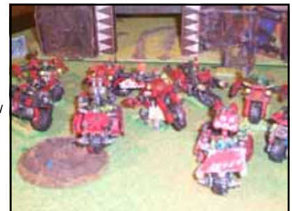
The use of Space Marine and Chaos bikes with Ork parts create individualistic Mobz.